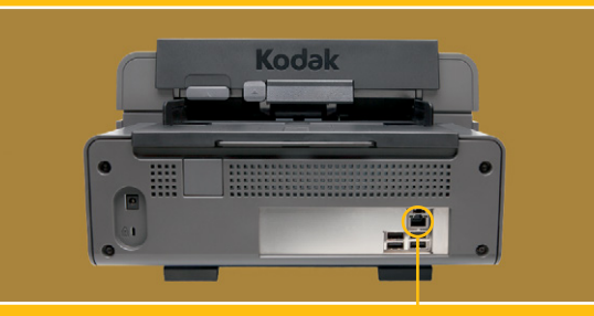
rd Internal andling modem